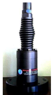
Antenna Base NATO/ USA 4 hole pattern mounting